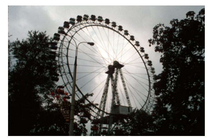
This is a picture of the famous Ferris wheel in Gorky Park. Impressive until you get in and have a really close look at one of the welds that held the wheel together...