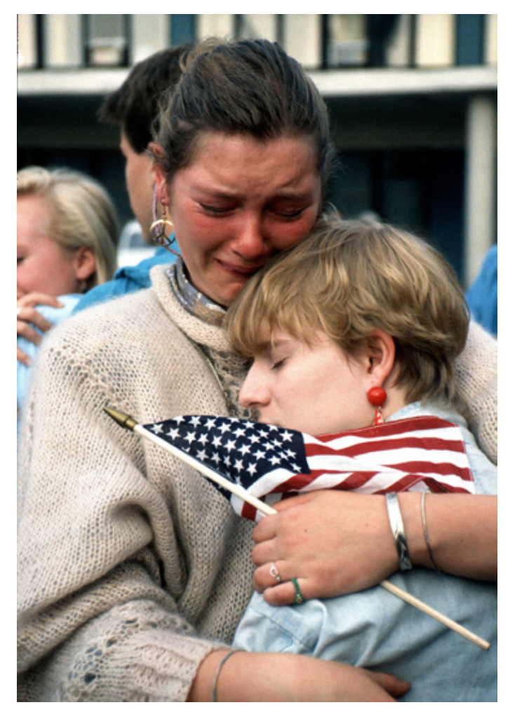
For some of the teenage actors, the final parting meant tears.

http://tinyurl.com/8rybm93 (but the impact of the story is the same).